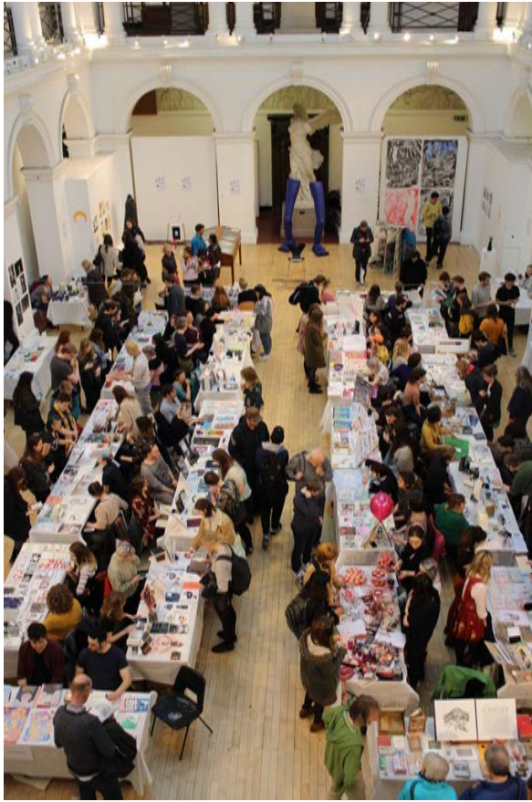
Figure 1. (Left) Bookmarks event held in the Sculpture Court, Edinburgh College of Art