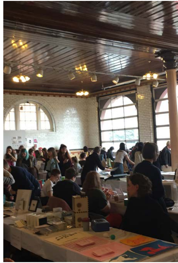
Figure 2. (Right) The event this year was held in the Lauriston Fire Station, a new exhibition and event space at Edinburgh College of Art

The Bookmarks model offers a solution to these challenges in the form of a book fair, open to the public and offering free stalls to current students, staff and alumni from Edinburgh College of Art , and also bringing together staff and students from other educational institutions and organisations which use the creative book form in teaching and learning. Over four years the event has been complimented by a symposium and a series of talks and workshops engaging discussion around the use of the book in education. The event gives the participants direct experience of self-publishing and encourages collaboration and dialogue between students, graduates and also staff as practitioners. This supports students in finding and creating identities, celebrates the handmade and encourages autonomy in learning. It is worth mentioning that although the event itself is designed to support all students and practitioners working with the book form and has included Graphic Designers, Artists and Animators, this paper reflects specifically on students studying Illustration as the design and running of the event was founded here and is focussed on this community.