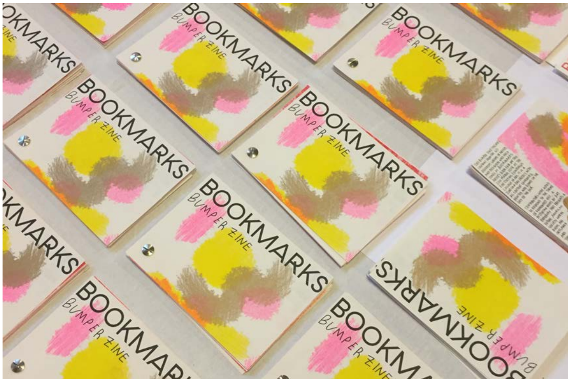
Figure 3. (Top) Risograph flutter book zines designed by Second year Illustration students in response to a field trip to Oban on the West Coast of Scotland. An edition of 10 of each zine was printed. The project was designed by Astrid Jaekel, Teaching Fellow in Illustration at Edinburgh College of Art (Lucy Roscoe, 2017).