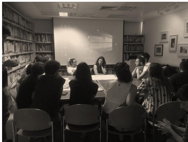
Figure 7: Illustration and Text, Third year, Illustration class- 2017

As in many leading academic departments of art and design worldwide, most of our lecturers operate successfully in the professional field, but did not experience professional training as teachers. In addition, many of them are graduates of the