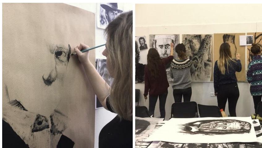
Figure 9: Introduction to Illustration course, First year- 2018

Another characteristic of the learning environment is the performative aspect of teaching: the unique way in which the lecturer teaches. This allows the lecturer to instill in his student's values that are more abstract, such as enthusiasm, curiosity, daring and irony, by modeling his "classroom persona".