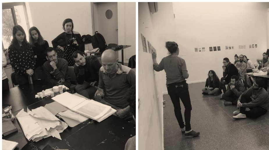
Figure 5: Illustration and Text, Third year, Illustration class- 2017

The VC Department at Bezalel offers a four-year undergraduate program for 400 students and includes more than 80 teachers. The first two years focus on foundation subjects, and all courses are required. These introduce the students to the basic knowledge of the discipline and equip them with the basic skills of typography, layout design, branding, interaction design, game design, motion design and illustration, alongside traditional foundations such as drawing and photography. It is a highly demanding and intense program, which ensures that after the first two years, the average student is capable of successfully dealing with a basic VC challenge using more than one approach. The next two years of the program cater to both students who wish to specialize in one or more discipline, and to students who wish to acquire multidisciplinary knowledge.