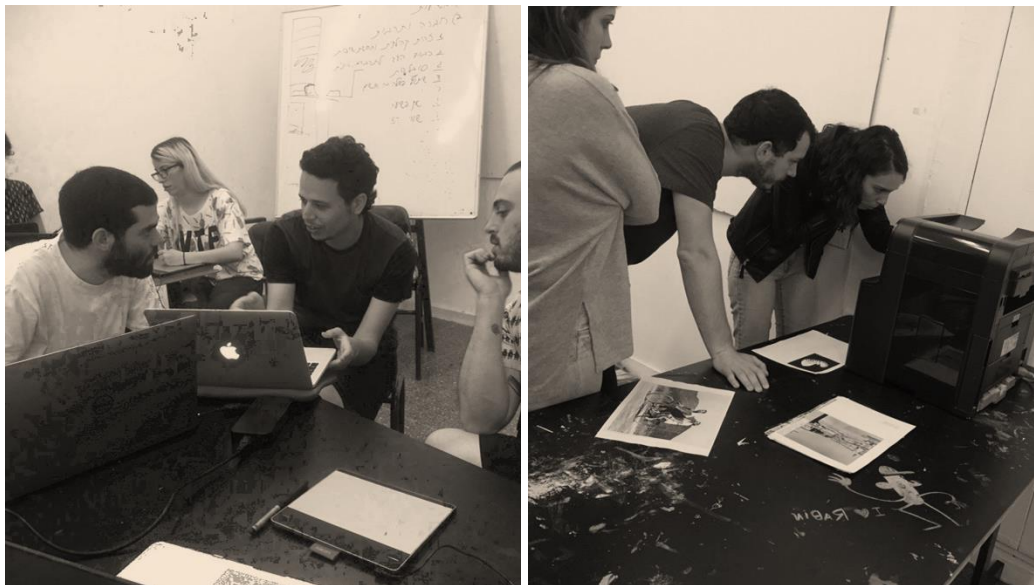
Figure 6: Illustration and Text, Third year, Illustration class- 2017

The objective of the Teaching Space is to cultivate, validate and develop teaching in the department. Focusing on the question, "How do we teach?" Our systematic observation of teaching and learning allowed us to conceptualize the various approaches and methods, analyze their modes of operation and assess their strengths and weaknesses, identify opportunities and obstacles, to elicit insights that could be applied to useful tools for quality, meaningful and relevant teaching. This approach created a safe space that enabled the lecturers to sincerely take part in the process, share, dare and err without fear of judgment or failure.