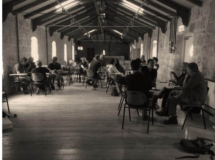
Figure 14: Teaching Space Seminar- November- 2017