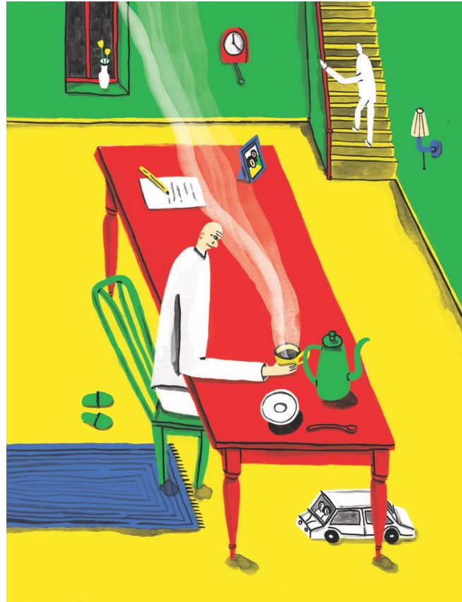
Figure 23: Anat Warshavsky- Graduated- 2015

For students today, time and geographical distance have become insignificant given the internet and the low cost of travel. The new media platforms and means of production challenge traditional hierarchies. The sources of information and channels of distribution, marketing and advertisement have changed. We are in the midst of the visual age where the image rules. This age is also characterized by an overflow of information in the form of multiple decontextualized images, most of which are mediated through a small two-dimensional screen of fixed proportions and directed at an individual consumer.