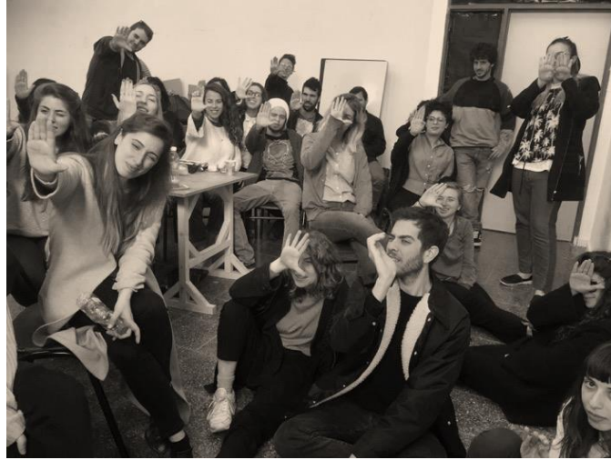
Figure 15: Introduction to Illustration course, First year- 2015

As a tool, contracts are effective in other contexts as well, such as between the department and lecturers or as part of a specific exercise. Contracts can also be useful as local tools in a critical discussion of student works, where the lecturer defines the rules in advance and reduces the element of surprise.