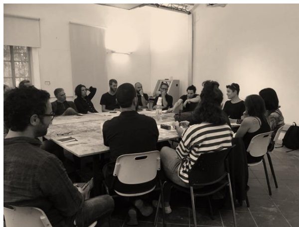
Figure 10: Teaching Space Seminar- October 2015

The study of teaching and learning in the department is primarily a voyage of exploration, identifying spaces of teaching and learning, mapping and conceptualizing them. The mapping process is ongoing, allowing constant fine-tuning of the learning and teaching activities in the department.