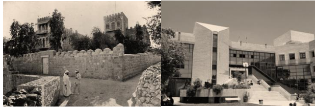
Figure 2: Bezele Buildings – 1906/2018