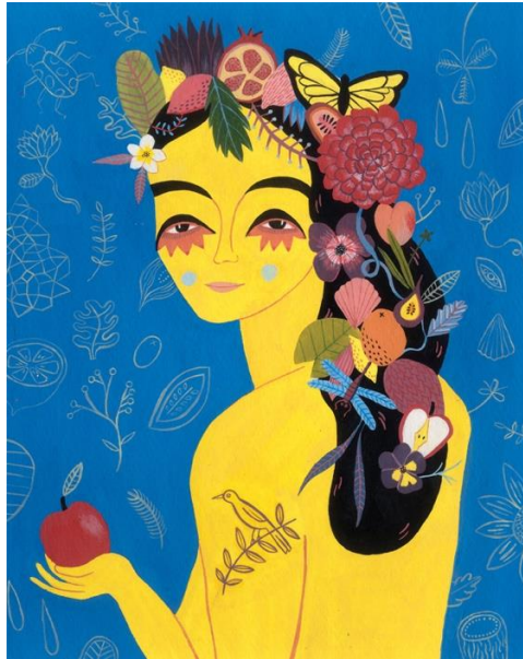
Figure 24: Noa Snir- Graduated- 2012

Today's students are millennials. This means that we often find ourselves required to mediate between their worldviews, expectations and values and those of their lecturers. Nevertheless, generation gaps have always been inherent to teaching, and in fact have always provided, through frictions and tensions, a generator for action and a motivation for change. Hence, the discussion of the future of teaching cannot refer only to the question of how we teach. Facing forward also involves difficult challenges regarding what we teach. Are we to teach illustration and design software, or can today's students be expected to master them independently? What is the proper role of digital illustration in the early stages of learning? Should we continue teaching drawing and print making? Should students know the difference between coated and uncoated paper? Is there any point in teaching editorial illustration for newspapers?