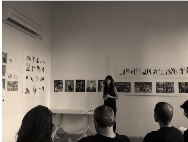
Figure 17: Fourth year Final Project Presentation- 2013

Critical observations and reflections are held from the candidate screening stage and all the way to the Final Project at the end of the four-year program. The forms of critique include feedback by a teacher, by peers, individually or in groups, feedback by visitors, verbal and written.