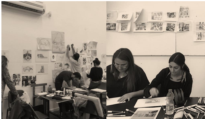
Figure 8: The Language of Illustration course, Second year- 2016

Consequently, learning and teaching in the department are mostly based on evolving traditional methods of experiential learning, learning by doing, practice and reflection. Experiential learning can be defined as learning through reflection on doing. Kolb (Kolb 2014) views learning as a four-stage, continuous process where the participant acquires knowledge from each new experience. His theory treats learning as a holistic process where one continuously creates and implements ideas for improvement. According to Kolb, effective learning can only take place when an individual completes a cycle of the four stages: concrete experience, reflective observation, abstract conceptualization and active experimentation. In a sense, the approach to teaching in the department continues to follow the master-apprentice tradition, where the lecturer is considered a master-teacher or a mentor whose authority derives above all from his or her professional status. Thus, teaching simulates professional working processes in the course of which the lecturer shares his experience with the apprentices-students, but also guides their way into the discipline in a transformative process at the end of which they become illustrators and designers.