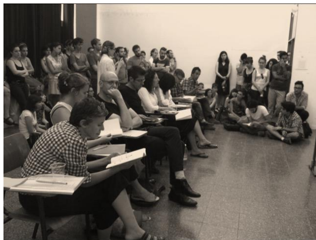
Figure 16: Fourth year Final Project Presentation- 2013

One of the themes arising in all territories was the Critique. Public “crit” of student works is a significant tool in all art and design departments used to promote learning, for formative and summative assessment and for professional acculturation. Our Departments’ vision is to nurture graduates that are critical and opinionated with interpretive skills, have a sense of responsibility, motivation and self-efficacy. To cultivate those qualities, we aspire to use different forms of critical manifestations and appreciation.