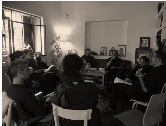
Figure 12: New Lecturers Seminar session- December- 2017

Another arena of the Teaching Space is the new lecturers. Every year, the department is joined by several lecturers of different ages, with varying experience in teaching different types of courses. Therefore, their training process involves both group meetings and facilitation, alongside individual supervision by a mentor – a senior lecturer from the department.