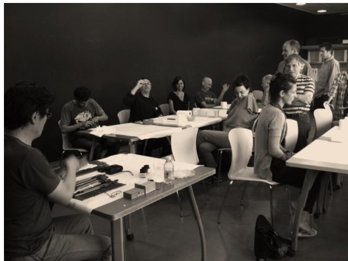
Figure 11: The Teaching Space Seminar, Japanese Calligraphy Workshop- May 2012