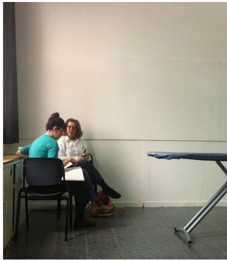
Figure 3: Maira Kalman's Master Class- 2013

The Teaching Space project began in the Illustration Track at the Department of Visual Communications (VC) some six years ago as part of the development of the Teaching Center in Bezele. The project was designed to explore teaching approaches and methods in the track and the department, formulate the lecturers' tacit knowledge and develop their teaching knowledge and skills. This process is aimed at encouraging the lecturers' engagement with the practice of teaching, to validate teaching as a significant aspect of their professional identity, and to open up new space for thought and action in teaching illustration and design.