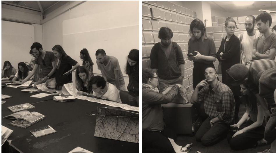
Figure 4: The Language of Illustration course, Second year- 2017

The VC Department at Bezalel offers a four-year undergraduate program for 400 students and includes more than 80 teachers. The first two years focus on foundation subjects, and all courses are required. These introduce the students to the basic knowledge of the discipline and equip them with the basic skills of typography, layout design, branding, interaction design, game design, motion design and illustration, alongside traditional foundations such as drawing and photography. It is a highly demanding and intense program, which ensures that after the first two years, the average student is capable of successfully dealing with a basic VC challenge using more than one approach. The next two years of the program cater to both students who wish to specialize in one or more discipline, and to students who wish to acquire multidisciplinary knowledge.