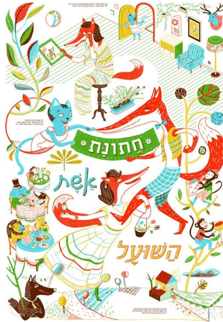
Figure 27: Eitan Eloa- Graduated- 2015

The transformation was instantaneous. Once responsibility for project management was delegated to the students, the very need to formulate a question about their creative process, and without having to give up on the lecturer's ongoing support, they became the project's owners, responsible for its successful completion. They asked concrete questions, such as, "Should the figure smile or not?", "Should I change the color of the sky to a darker tone?"; fundamental questions such as, "Do you find this work interesting?", "Is it communicative?"; and questions related to work processes, such as "Where do you find inspiration beside Pinterest?".