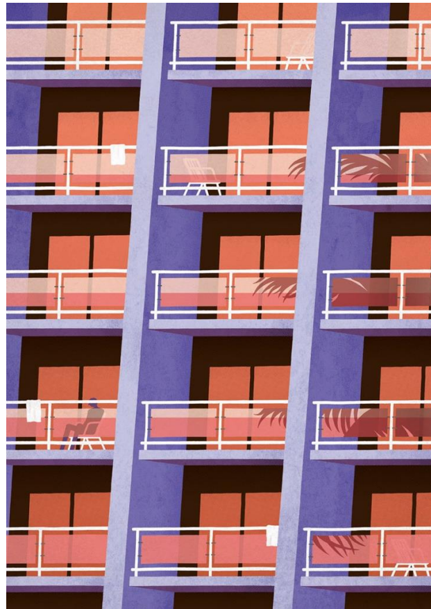
Figure 22: Niv Tishbi- Graduated- 2012

existing and new arenas, establish a well-organized program for training lecturers, expanding their toolbox, integrate students in the development processes and address complex issues such as student evaluation and grading.