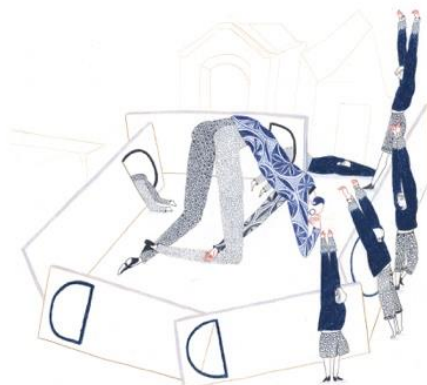
Figure 25: Keren Katz- Graduated- 2010

Today's students are millennials. This means that we often find ourselves required to mediate between their worldviews, expectations and values and those of their lecturers. Nevertheless, generation gaps have always been inherent to teaching, and in fact have always provided, through frictions and tensions, a generator for action and a motivation for change. Hence, the discussion of the future of teaching cannot refer only to the question of how we teach. Facing forward also involves difficult challenges regarding what we teach. Are we to teach illustration and design software, or can today's students be expected to master them independently? What is the proper role of digital illustration in the early stages of learning? Should we continue teaching drawing and print making? Should students know the difference between coated and uncoated paper? Is there any point in teaching editorial illustration for newspapers?