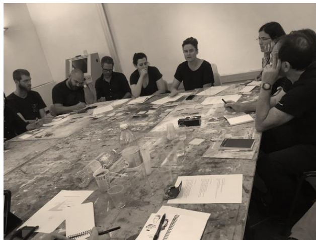
Figure 21: Teaching Space Seminar- October- 2015

Devoting attention to teaching and learning has clearly opened up a new and exciting space for continual development. Placing the lecturer at the center of the field of study has created an empowering effect, providing an opportunity for honest reflection and motivating change. The project's research practices have been adopted in the form of learning design tools, and at the same time perceived as a way for the department to invest in and cultivate its teaching staff. This in turn led to a paradigmatic shift in the historical relationship between the department and lecturer, maximizing the willingness to engage in reform.