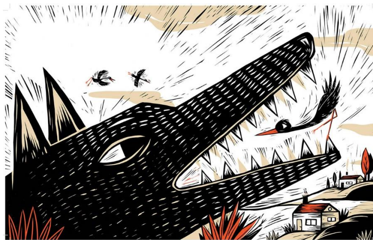
Figure 26: Or Yogev- Graduated- 2017

Since the practice of the Teaching Space involves ongoing systematic observation and analysis to identify challenges and opportunities, it is ideally suited to the changing reality and the new generation. The Teaching Space operates in a way that enables us to overcome the changing challenges of teaching illustration – and teaching in general – in our times. By its very nature, the reflection on the lecturer and her role as the designer of a meaningful learning environment attracts attention to questions of relevance and the changing needs of the discipline. These can refer to implementing a new technology in the classroom; cultivating proactive, independent, and agile students; promoting enterprise and market savvy; addressing accountability and ethics; as well as creating conditions conducive to learning for this generation of restless students – and the next.